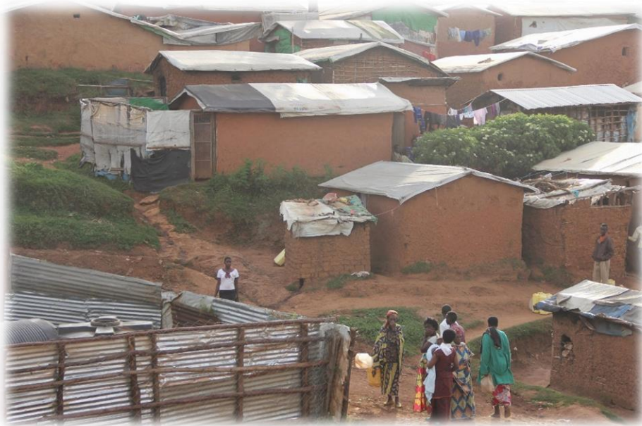
Gihembe Refugee Camp, Rwanda